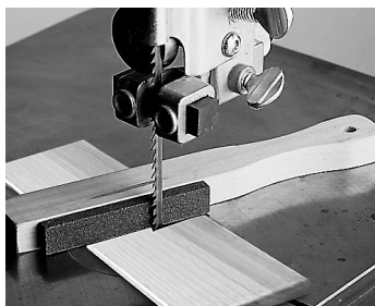
Figure 2: For 1/16" and 1/8" blades advance the wood into the blade while using the stone.