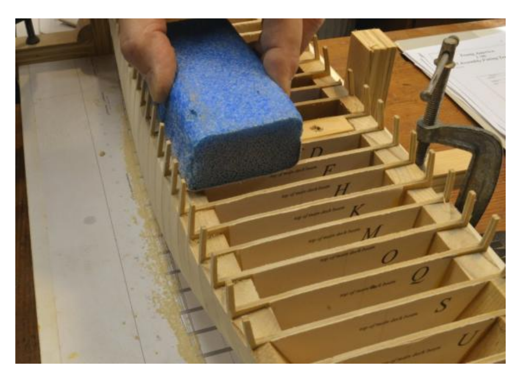
Fairing of the deck was particularly important to avoid waviness in the thin deck planking that would be added later. In the next picture this is being checked during the sanding process using a pine batten.